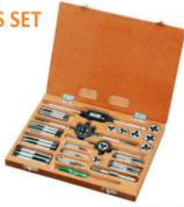
Code No. 713 TAPS & DIES SET