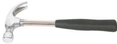
Code No. 636 CLAW HAMMER TUBULAR

Drop Forged With Handle HSN CODE 82052000