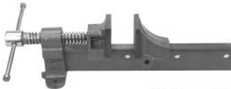
Code No. 664 T-BAR CRAMP