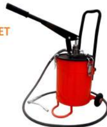
Code No. 695 GREASE BUCKET