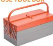
Code No. 670 MULTI PURPOSE TOOL BOX