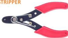
Code No. 627 WIRE STRIPPER