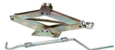
Code No. 674 SCISSOR JACK