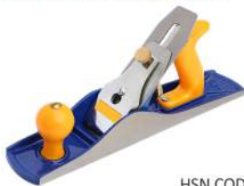
Code No. 665 JACK PLANE WITH BRASS NUT