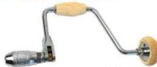
Code No. 668 CARPENTER RATCHET BRACE