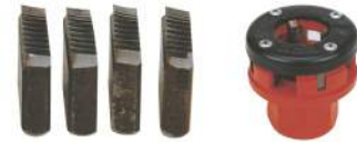
Code No. 659 SPARE CHASER & COLLET FOR DIE HEAD