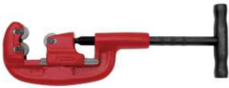
Code No. 663 PIPE CUTTER