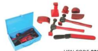
Code No. 687 BODY FENDER TOOL KIT