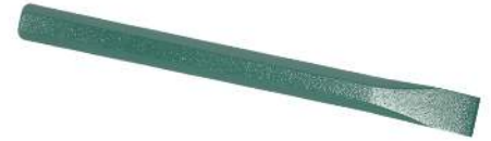
Code No. 710 CHISELS