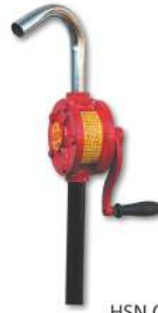
Code No. 692 BARREL PUMP