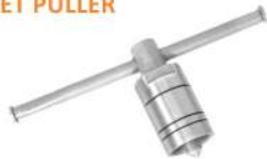
Code No. 691 MAGNET PULLER