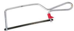
Code No. 700 HACKSAW FRAME