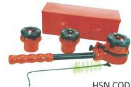
Code No. 658 RATCHET PIPE THREADER