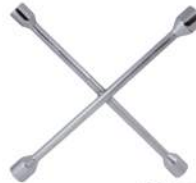
Code No. 615 4 WAY WHEEL SPANNER