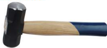
Code No. 641 SLEDGE HAMMER