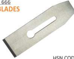
Code No. 666 SPARE BLADES