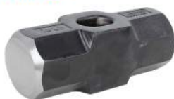
Code No. 640 SLEDGE HAMMER