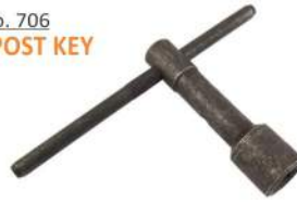
Code No. 706 TOOL POST KEY