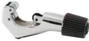
Code No. 662 TUBE CUTTER