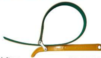
Code No. 680 FILTER WRENCH DROP FOEGED