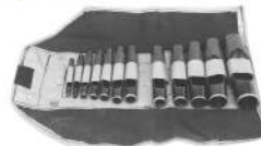
Code No. 708 BELT PUNCH KIT