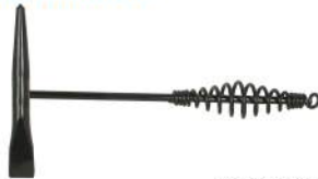
Code No. 639 CHIPPING HAMMER