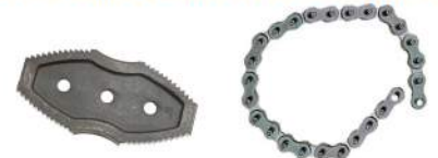
Code No. 660 SPARE CHAIN & PLATES FOR CHAIN WRENCH