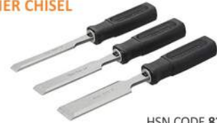
Code No. 671 FIRMER CHISEL