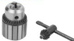
Code No. 715 DRILL CHUCK WITH KEY