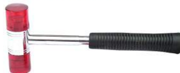
Code No. 642 SOFT FACE Mallet HAMMER