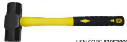
Code No. 647 SLEDGE HAMMER WITH FIBERGLASS HANDLE