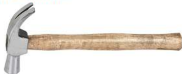
Code No. 637 CLAW HAMMER