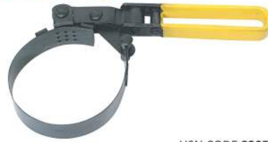
Code No. 679 OIL FILTER WRENCH