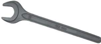
Code No. 610 SINGLE OPEN END SPANNER