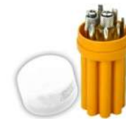
Code No. 721 SCREWDRIVER KIT - SET OF 8 PCS.