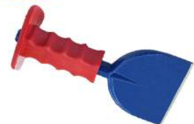
Code No. 712 BRICK BLOSTER