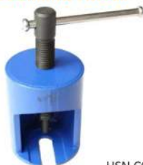
Code No. 705 ARMATURE BEARING PULLER