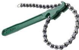
Code No. 690 FILTER WRENCH CHAIN TYPE