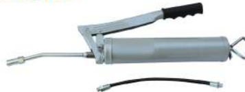
Code No. 694 GREASE GUN