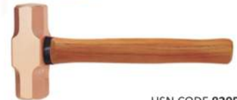
Code No. 746 COPPER HAMMER