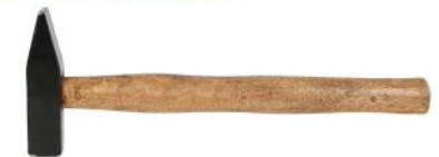
Code No. 635 MACHINIST HAMMER

Drop Forged With Handle HSN CODE 82052000