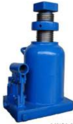
Code No. 676 HYDRAULIC JA