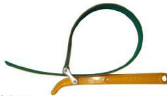
Code No. 634 FILTER WRENCH DROP FOEGED