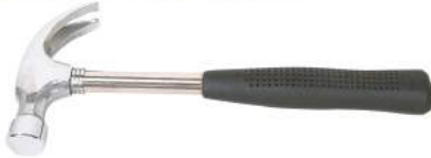
Code No. 651 CLAW HAMMER TUBULAR