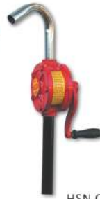
Code No. 632 BARREL PUMP