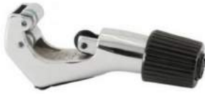
Code No. 703 TUBE CUTTER