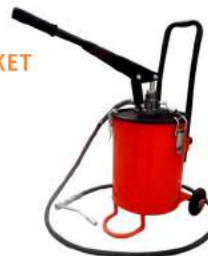
Code No. 691 GREASE BUCKET