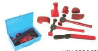
Code No. 704 BODY FENDER TOOL KIT