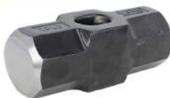
Code No. 655 SLEDGE HAMMER