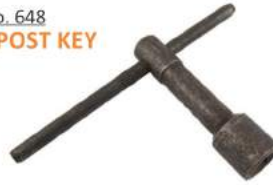
Code No. 648 TOOL POST KEY