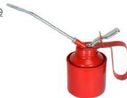
Code No. 689 OIL CAN