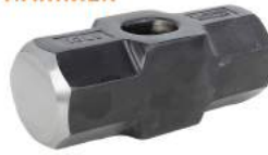
Code No. 655 SLEDGE HAMMER