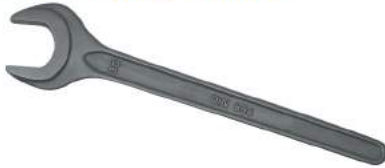
Code No. 609 SINGLE OPEN END SPANNER