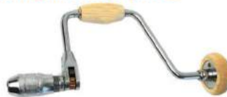
Code No. 704 CARPENTER RATCHET BRACE