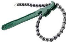
Code No. 634 FILTER WRENCH CHAIN TYPE