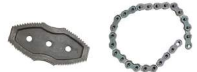
Code No. 679 SPARE CHAIN & PLATES FOR CHAIN WRENCH