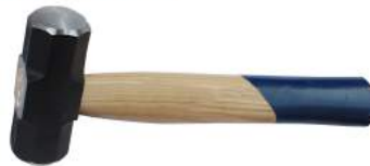
Code No. 656 SLEDGE HAMMER