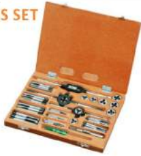
Code No. 684 TAPS & DIES SET