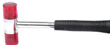
Code No. 657 SOFT FACE MALLET HAMMER