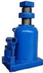
Code No. 624 HYDRAULIC J.