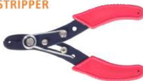
Code No. 644 WIRE STRIPPER