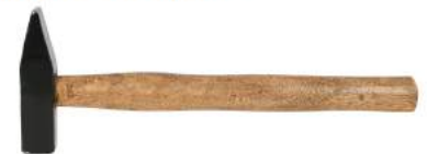
Code No. 650 MACHINIST HAMMER

Drop Forged With Handle HSN CODE 82052000