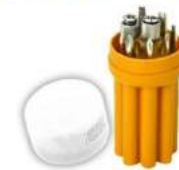
Code No. 703 SCREWDRIVER KIT - SET OF 8 PCS.