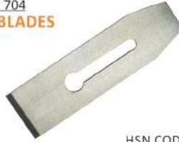
Code No. 704 SPARE BLADES