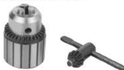
Code No. 666 DRILL CHUCK WITH KEY