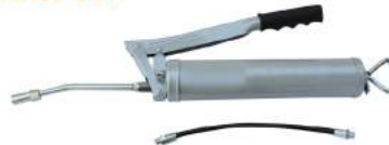
Code No. 690 GREASE GUN