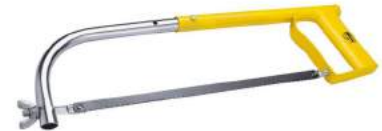
Code No. 670 HACKSAW FRAME