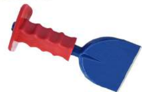
Code No. 703 BRICK BLOSTER