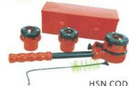
Code No. 675 RATCHET PIPE THREADER