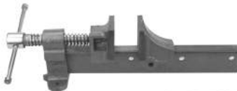
Code No. 667 T-BAR CRAMP