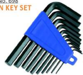
Code No. 698 ALLEN KEY SET