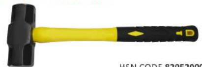
Code No. 656 SLEDGE HAMMER WITH FIBERGLASS HANDLE