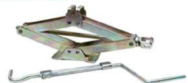
Code No. 626 SCISSOR JACK