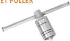
Code No. 663 MAGNET PULLER