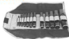
Code No. 664 BELT PUNCH KIT