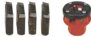
Code No. 676 SPARE CHASER & COLLET FOR DIE HEAD