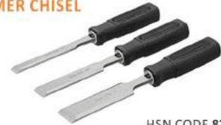
Code No. 684 FIRMER CHISEL