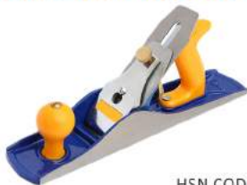
Code No. 704 JACK PLANE WITH BRASS NUT