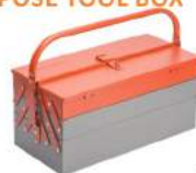
Code No. 621 MULTI PURPOSE TOOL BOX