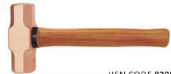
Code No. 700 COPPER HAMMER