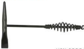
Code No. 654 CHIPPING HAMMER