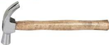
Code No. 652 CLAW HAMMER