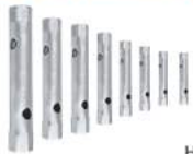
Code No. 611 TUBULAR BOX SPANNER SET