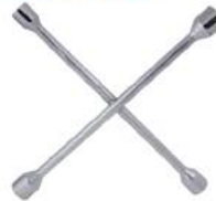
Code No. 614 4 WAY WHEEL SPANNER