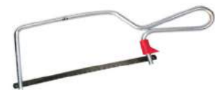
Code No. 672 HACKSAW FRAME