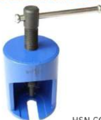
Code No. 680 ARMATURE BEARING PULLER