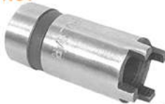
Code No. 704 CLUTCH NUT